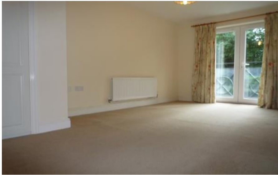
Bedroom One – 4.82m x 2.75m