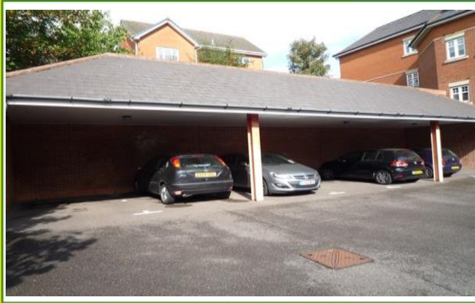
Allocated Covered Parking Space.