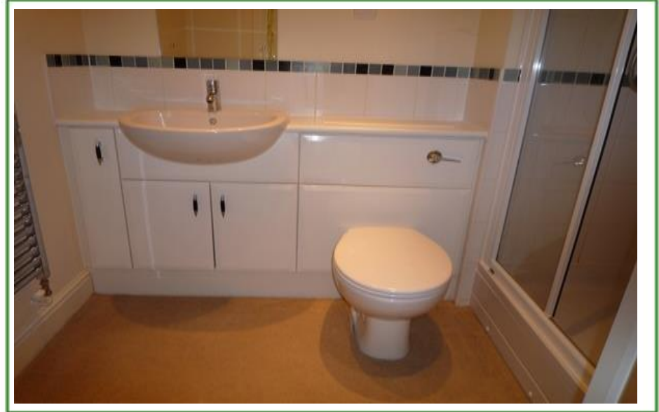
Ensuite Shower Room 2.29m x 1.49m

Chrome Heated Towel Rail White Ceramic WC, Washhand Basin in Vanity Units. Double Shower with Folding Glass Door